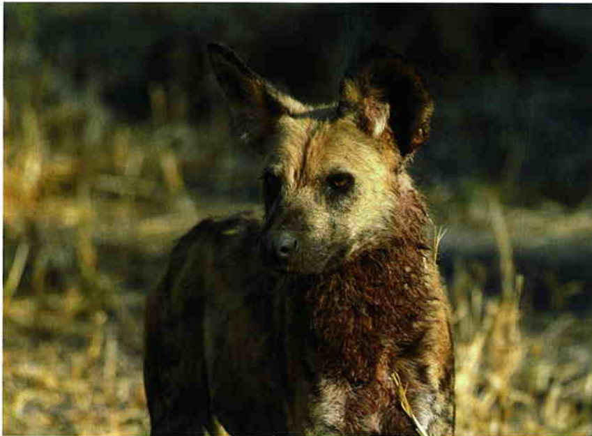
African wild dog ( Lycaon pictus ).

Lindsey, P.A. et al. 2005. The potential contribution of ecotourism to African wild dog Lycaon pictus conservation in South Africa. Biological Conservation 123(3):339-348.