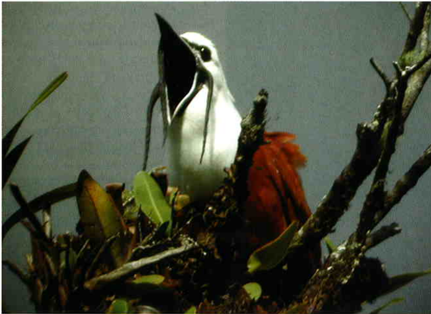
Three-wattled bellbird ( Procnias tricarunculata). at Monteverde, March 2001